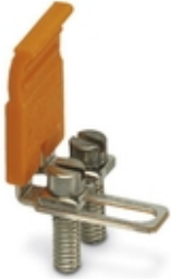
Switching jumper, pitch: 8.2 mm, number of positions: 2, color: silver

Please be informed that the data shown in this PDF Document is generated from our Online Catalog. Please find the complete data in the user's documentation. Our General Terms of Use for Downloads are valid ( http://phoenixcontact.com/download )